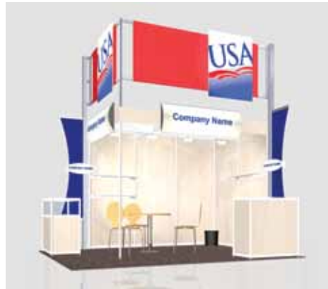
12 sqm corner booth depicted. Booth design subject to change.

Participation in the official USDA-endorsed USA Pavilion at SIAL Paris 2012 offers you the prestige and visibility of exhibiting with other US companies while keeping your own identity – your individual booth with a cost-effective, complete service package eliminating communication lag-time and currency transfers.